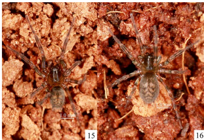
图版 III 威宁栅蛛 Hahnia weiningense sp. nov. 生态照

10~12. 雄蛛正模: 左触肢, 10. 腹面观, 11. 外侧观, 12. 背面观; 13~14. 雌蛛副模: 外雌器, 13. 腹面观, 14. 背面观; At. 交配腔, CD. 交配管, CF. 跗舟沟, Em. 插入器, FD. 受精管, Ho. 垂兜, MA. 中突, PA. 膝节突, RTA. 胫节外侧突, Sp. 纳精囊, Ss. 副纳精囊 10-12. male holotype: left palp, 10. ventral view, 11. retrolateral view, 12. dorsal view; 13-14. female paratype: epigyne, 13. ventral view, 14. dorsal view; At. atrium, CD. copulatory duct, CF. cymbial furrow, Em. embolus, FD. fertilization duct, Ho. hood, MA. median apophysis, PA. patellar apophysis, RTA. retrolateral tibial apophysis, Sp. spermatheca, Ss. subspermatheca